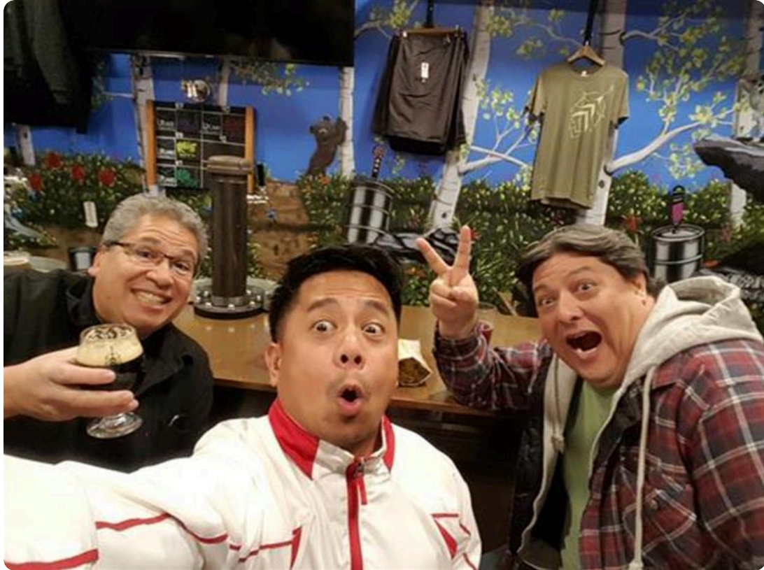
Da 3 Amigos!!!